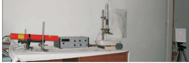
Figure 1: Photograph of the experimental set-up.

which is suitable for experimental determination of the surface tension. Apparatus for measuring the wavelength of capillary waves (Figure 1) consists of: signal generator, oscilloscope, speaker, micrometer, liquid, styrofoam container, screen, CCD camera, meter tape, thermometer and cardboard (or a metal plate). Capillary waves are induced by sinusoidal oscillations from the speaker that are transmitted on the plane booster 1 on the surface of the fluid.